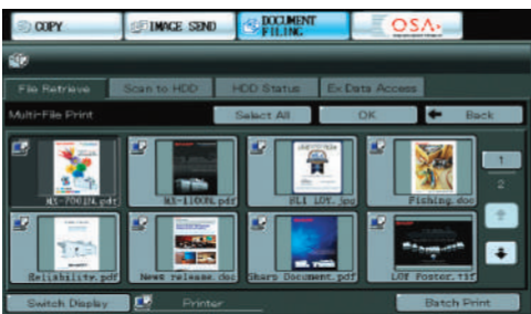
Sharp's easy-to-use Document Filing System with thumbnail preview