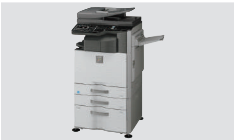
Available paper capacity stores up to a maximum of 3,100 sheets with options