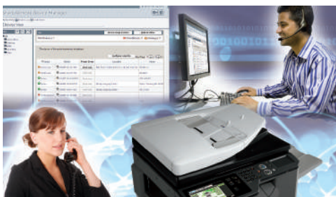
Sharp Remote Device Management