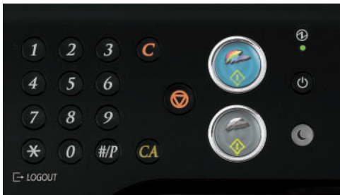
Separate print buttons for B&W and Color allow users to selectively manage use of color

Make management of your MX-2615N/MX-3115N simple and straight forward with Sharp Remote Device Management (SRDM). This easy-to-use software allows you to take control of the versatile system features and simplifies installation and management.