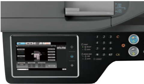
High-resolution touch screen with Stylus pen for easy point-and-touch operation